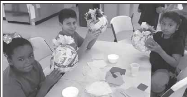
Kids in the after school program at Pomona's Garfield Neighborhood Center were hard at work last month making their own pinatas. Want to try this at home? Here's the secret -- you start by blowing up a small balloon. Pretty cool, huh. Then you use newspaper strips for your paper mache. It obviously works best if you use La Nueva Voz -- after all, that's what these kids were using! (See that ad for Kaboom! at Fairplex?). Then you paste on your colorful crepe paper decorations. And then, after everything is dry, comes the tricky part -- cut your hole very carefully -- you'll pop that balloon but you'll be able to fill your pinata with candy!

Lincoln Park is located at Palomares Street and Lincoln Avenue in Pomona.