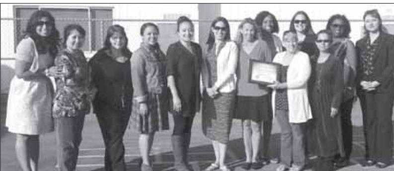
WINNERS OF STATE GOLDEN RIBBON SCHOOLS AWARD -- Two schools in Pomona Unified School District -- Armstrong Elementary and Pantera Elementary, both in Diamond Bar -- were named winners recently of the prestigious California Golden Ribbon Schools Award, presented by the State Department of Education to outstanding public schools demonstrating exemplary achievements in implementing state standards in priority areas. State Supt. of Public Instruction Tom Torlakson said in a news release that 780 elementary schools statewide were honored this year. The program replaced the California Distinguished Schools Program while California creates new assessment and accountability systems. Nearly 6,000 elementary schools were eligible to apply this year. Pictured outside the school with Armstrong's Golden Ribbon Award for the Arts (Arts and Music), from left, are Principal Cynthia Sanchez and teachers Annie Nguyen, Kristal Green, Kristina Martinez, Laura Alikan, Lanya Sassy, Jennifer Smith, Nan Sypowicz, LuzMaria Babbitt, Paula Richards, Jaime Santana, Trish Hatch and Monica Medina.