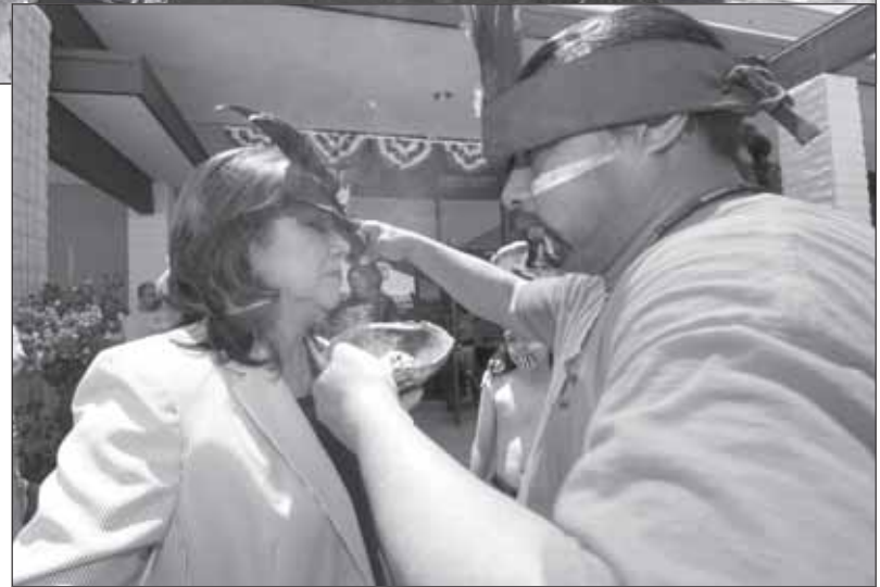
Los Angeles County Board of Supervisors Chair Hilda Solis receives a special blessing at the opening last month of her new field office in Pomona from a representative of the Native American community. The blessing, complete with the smoke from burning sage fanned by traditional eagle feathers, is believed to dispel negative energy and influences.

The new field office will service unincorporated communities of Claremont, Covina and Azusa and the cities of Azusa, Claremont, Pomona, Walnut and West Covina.