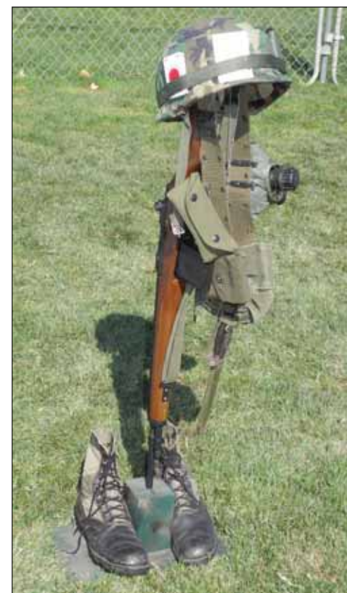
A "Fallen Soldier Battle Cross," a symbolic replacement of a cross or marker appropriate to an individual service member's religion, was on display at the Mobile Vietnam Veterans Memorial. The purpose is to show honor and respect for the dead at the battle site. The practice started during the American Civil War or even earlier as a means of identifying bodies on the battlefield before they were removed. Today, it is used more as a private ceremony among those still living as a means to mourn.