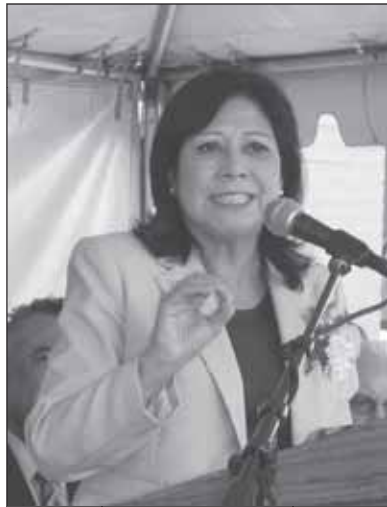
Los Angeles County Board of Supervisors Chair Hilda Solis welcomes her guests at the opening of her new field office, the first county supervisorial field office ever in Pomona.

Solis said the county also is looking at a massive improvement of the regional parks system and is looking at placing a parcel tax on the ballot to help improve the parks, adding