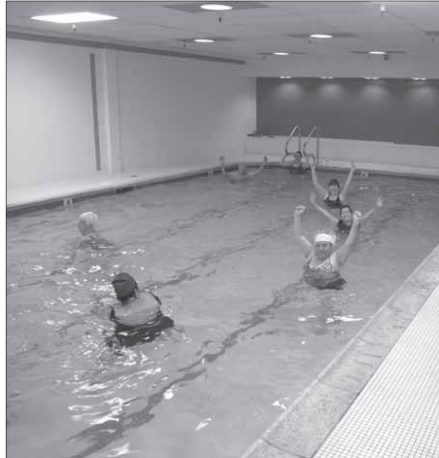
Swimmers get in their morning workout in this September 2012 file photo of the indoor pool at the YMCA of Pomona Valley in the now-closed facility at the Village at Indian Hill.

"The Y has a responsibility to serve the community as a nonprofit charity organization," the YMCA of Orange County said in a news media statement issued by its office of marketing and communications. "Sometimes this includes