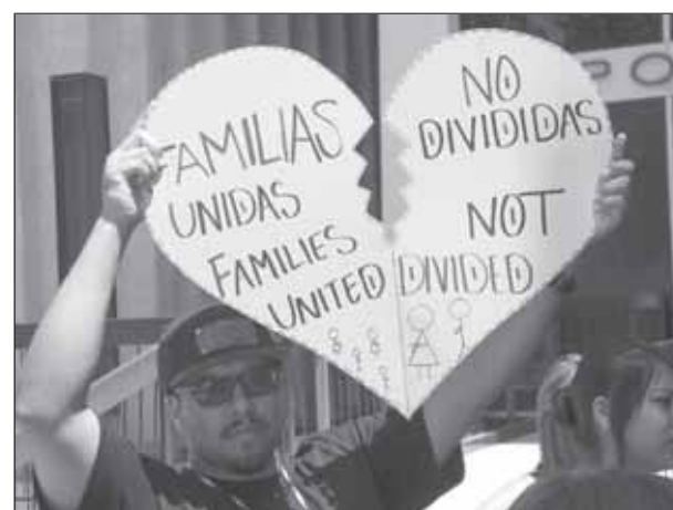
An unidentified protestor displays a “Families United, Not Divided” placard.

mented parents including many children who are citizens of this country suffer ongoing social and psychological harms due to fear of separation from parents, siblings and other loved ones. And the safety of all residents is threat-