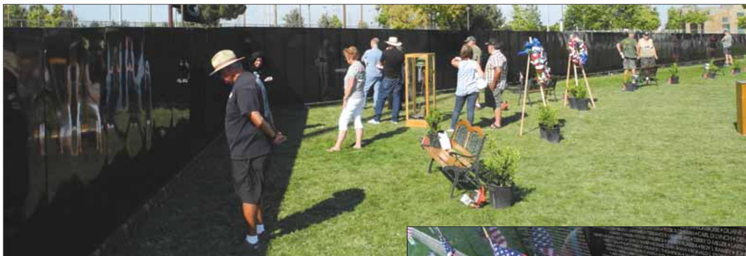
About half of the Mobile Vietnam Veterans Memorial is pictured on display this month in Chino.