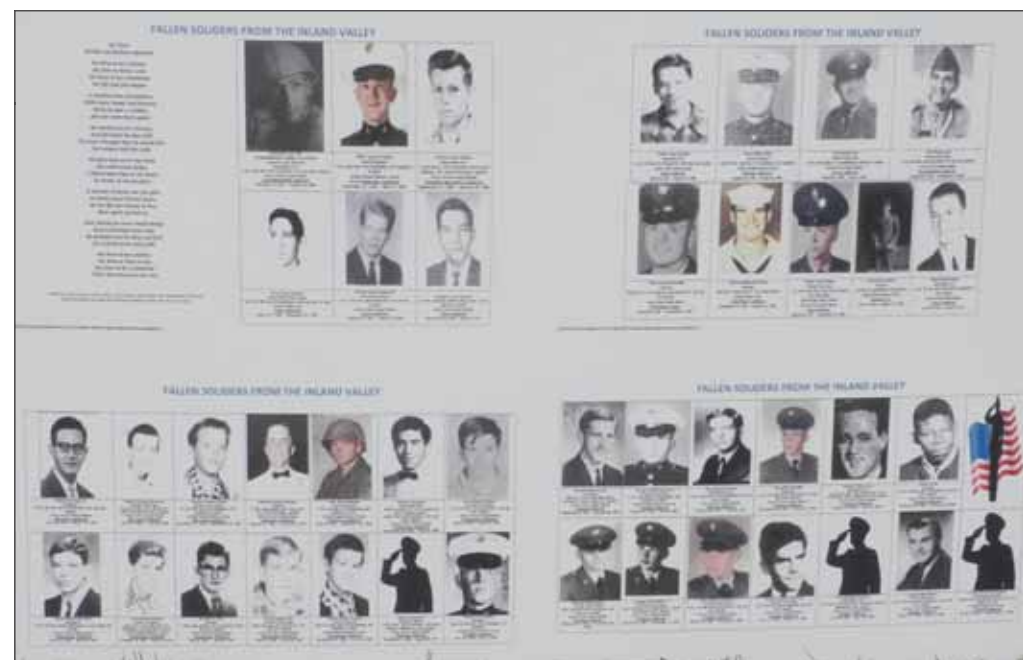
Fallen soldiers from the Inland Valley were recognized by name, rank, and branch of service on two large displays near the Mobile Vietnam Veterans Memorial. La Nueva Voz counted 24 brave soldiers from Pomona identified on the displays.