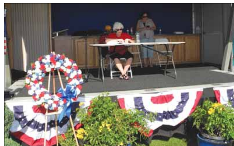
Volunteer readers alternated shifts throughout the day and night reading names from the Vietnam Veterans Memorial over a public address system as a solemn tribute this month at Ruben S. Ayala Park in Chino. The portable wall was on display from June 30 through July 5.

La Nueva Voz reaches 50% more readers in Pomona each month than the local suburban daily newspaper.