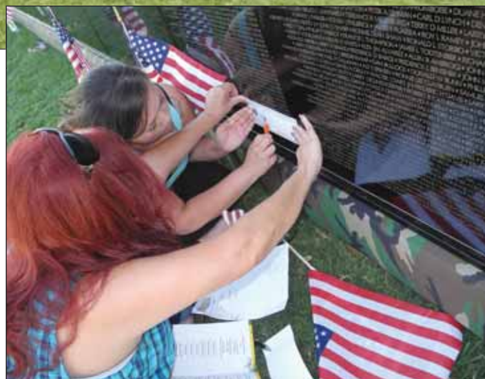
Visitors make a "rubbing" of one of the more than 58,000 names on the Mobile Vietnam Veterans Memorial during its visit this month at Ruben S. Ayala Park in Chino.