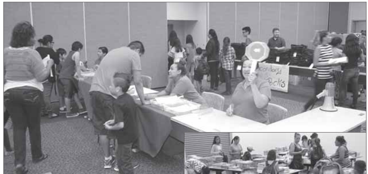
CHECKING IN FOR BACKPACKS -- Students were called up to the check-in table for their free backpacks after waiting in line with their mom or dad generally for about an hour and a half, although some lined up outside several hours before the doors opened at 8 a.m. earlier this month. Pomona Unified School District's Family Support and Resource Center coordinates the backpack give-away each year.

the student population of 25,000, or about 2,500 students, qualify as homeless. In addition, about 500 foster youth are in the system on average each year, coming from both families and group homes.