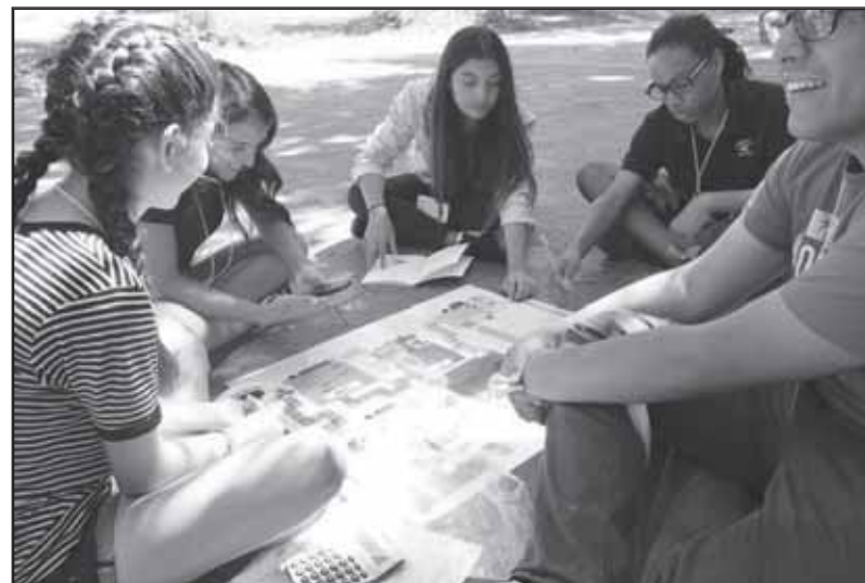
POMONA'S BRIGHT PROSPECT HOLDS FIRST SUMMER ACADEMY -- Pomona's Bright Prospect held its first-ever summer academy last month on the Pomona College campus in Claremont as the "intake" point for most of this year's new Bright Prospect students. The week-long program included workshops, a field trip to the California Science Center and a concert at the Hollywood Bowl. A second session was held this month at Claremont's Harvey Mudd College. About 115 students attended each session where topics included college life, setting goals, financial aid, scholarships and more. Pictured are 10th graders in the first session playing the "Value of a College Education" game in which they have to make budget choices for housing, transportation and food based first on the wages of an employee without a college education and then based on a salary they could earn as a professional. Bright Prospect serves about 2,000 students in high school and college, operating in high schools in Pomona, Montclair and Ontario. It empowers low-income students to gain admission to, succeed in and graduate from four-year colleges and universities by providing a comprehensive support system throughout the students' high school and college years.

Miss your copy of La Nueva Voz? Find back issues fast in our archives at www.lanuevavoz.net .