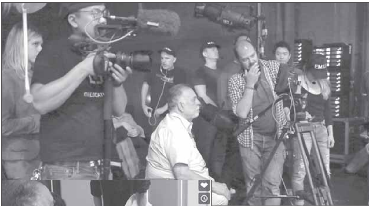
Director Francis Ford Coppola works with his crew on the set of "Distant Vision," an experimental "live broadcast" production last month at the UCLA School of Theater, Film and Television. Coppola received a master's degree in theater arts at UCLA in 1967.