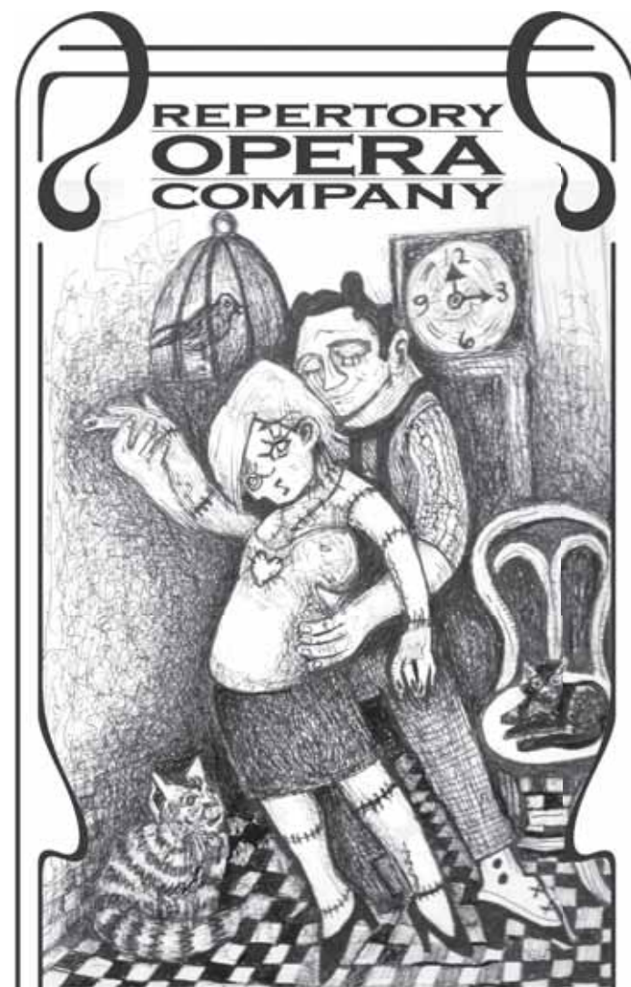
Illustration by Maggie Abeyta

For more information, visit www.ivhp.com or call (800) 500-7018.