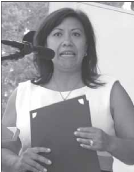
Congresswoman Norma Torres