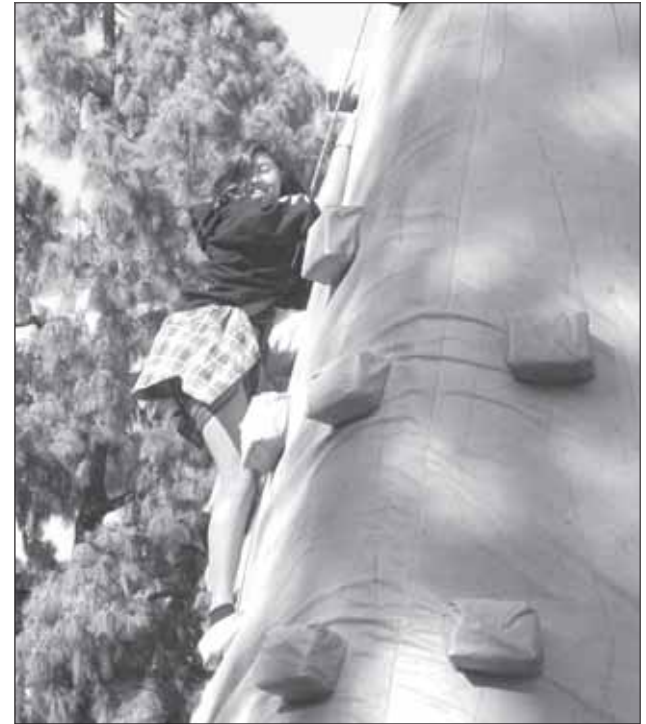
ROCK CLIMBING IN THE CIVIC CENTER -- An unidentified Pomona mountain climber does a little rock climbing on an inflatable "mountain side" this month during National Night Out in the Pomona Civic Center.

ment's Crime Prevention Unit and the City of Pomona in an event that nationwide was expected to attract more than 37.1 million participants to heighten crime and drug prevention awareness, generate support for and participation in local anticrime efforts, strengthen neighborhood spirit and police community partnerships, and send a message to criminals letting them know