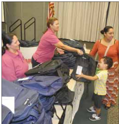
POMONA UNIFIED GIVES AWAY 3,000 BACKPACKS -- Volunteers and staff gave away a total of 3,000 backpacks filled with school supplies this month in the largest ever event of its kind in Pomona. Pictured in the conference center at the Village at Indian Hill are two students with their moms who picked out just the right backpacks for the new school year.